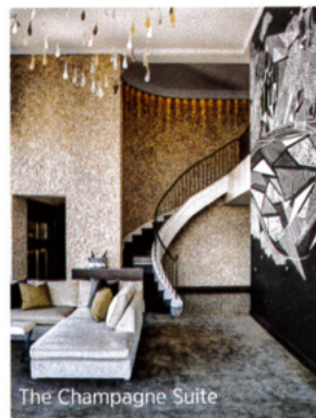
The Champagne Suite