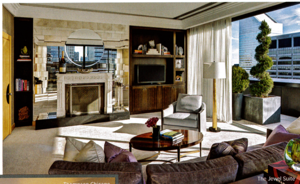
The Jewel Suite

Suite debuts from Manhattan to Marin County.