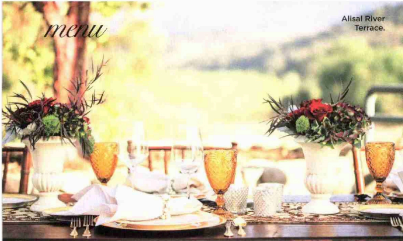
Alisal River Terrace.