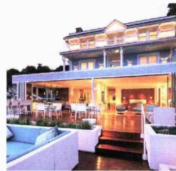
Casa Madrona has views of Sausalito, Richardson Bay and the hills of Belvedere.

SPECIAL DELIVERY At the just-renovated Casa Madrona in Sausalito, the 129-year-old mansion's room service department uses drones to assure complete privacy. This customizable airborne device can carry Champagne bottles and even rings straight to lovebirds. casamadrone.com .