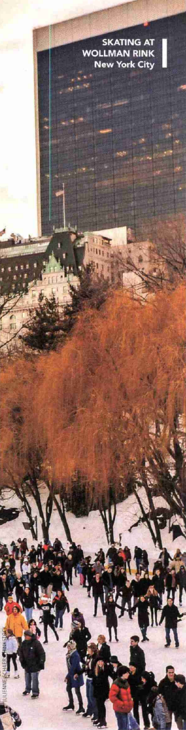
SKATING AT WOLLMAN RINK New York City