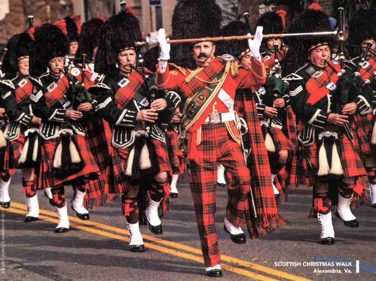
SCOTTISH CHRISTMAS WALK Alexandria, Va.