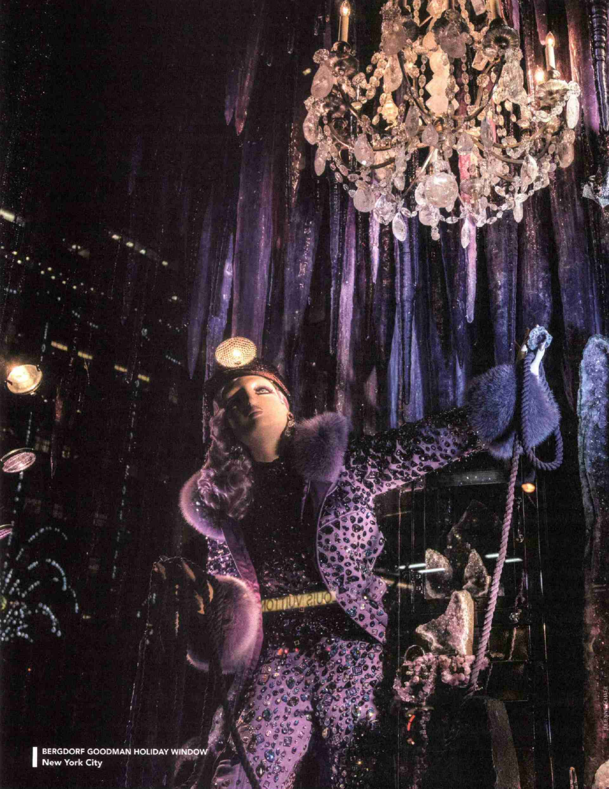
BERGDORF GOODMAN HOLIDAY WINDOW New York City