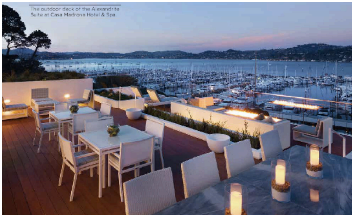
The outdoor deck of the Alexandrite Suite at Casa Madrona Hotel & Spa.