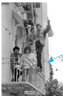
PINK FLOYD AT THE MANSION AT CASA MADRONA