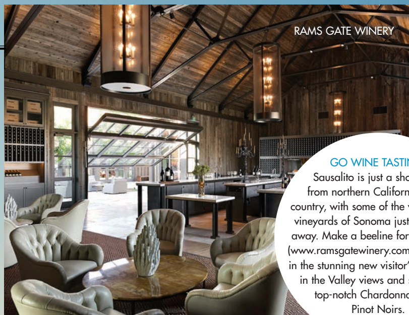
RAMS GATE WINERY