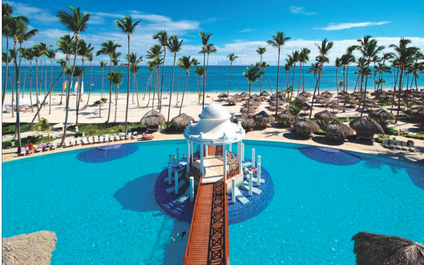
Paradisus Palma Real

afternoon has gone by as you go from pool to pool, water to water, which surrounds you both scenically and literally, seeping into your newly unknotted body for a full day of relaxation. On your honeymoon? Turn it into a Balimoon: Flower foot Bath and Tea Ceremony, Balinese Massage, Balinese Boreh (a warm, spiced wrap), and an Indian Scalp & Reflexology treatment, all created with couples in mind. Spa treatments range from $90 for 60-minute reflexology to $295 per person for a 3.5 hour couple's Balimoon. www.paradisus.com