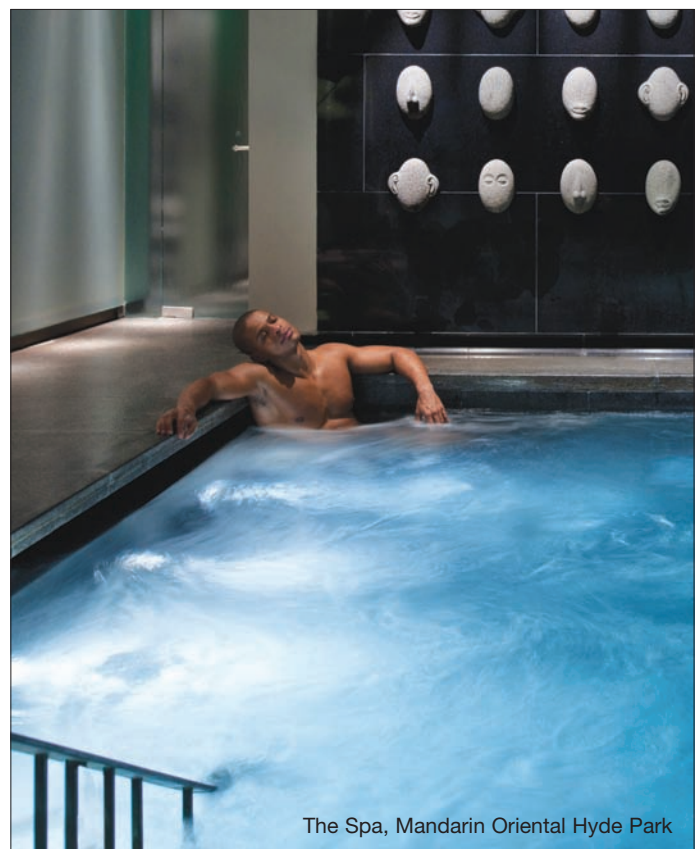
The Spa, Mandarin Oriental Hyde Park

Visiting Turkey without trying a hammam is akin to bypassing a kebab stand. It's a sin to skip either. To discover the methods ancient Ottoman and Turkish societies used to purify the body, head to one of the many hammams that dot this exotic city. But all hammams aren't built alike, that's why I chose the Chi Spa at the Shangri-La Bosphorus. Their replication of the 16th-century domed bathing house has an old-school feel, yet the gleaming blue marble and pristine steam room ensures a luxury experience. The Traditional Hammam Treatment (45min/$90) begins with a pore-opening, skin-softening sauna. Keep in mind, there's an option to wear a swimsuit, but don't be surprised to see women or men in the buff. Shyness may overcome you for a second, but soon it becomes apparent no one's staring at you, as they are engulfed in a personal nirvana. Besides, those clothes will soon become cumbersome. Next is a wash, followed