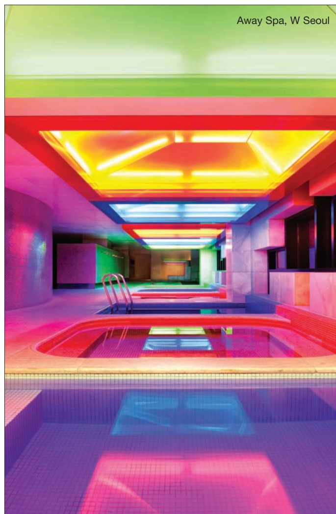
Away Spa, W Seoul